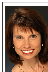
Did You Know? Margaret Peterson Haddix grew up on a farm in Ohio!

All Hilliard sixth grade buildings and middle schools will have the pleasure of hosting author Margaret Peterson Haddix in May of 2012. Mrs. Haddix has written a number of books for children and young adults but is probably best known for her Shadow Children and Missing series. Check out all her titles at www.haddixbooks.com .